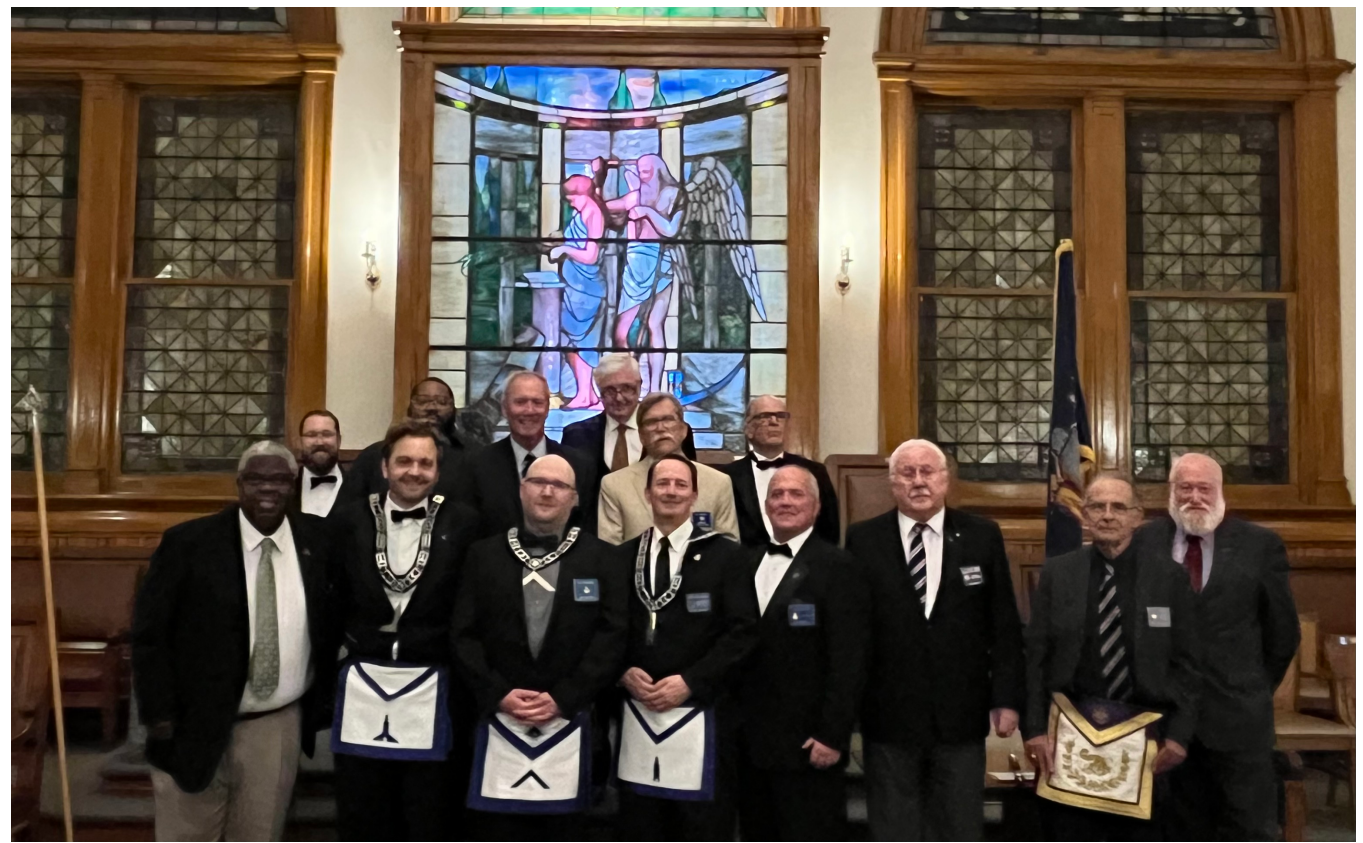
Group Photo by Heather Emory